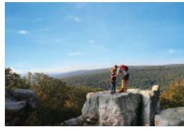
Catocin Mountain Park