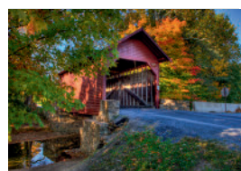
Roddy Road Covered Bridge