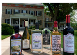
Springfield Manor Winery & Distillery