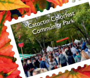
Catocin Colorfest Community Park