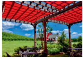
Catocin Breeze Vinyard