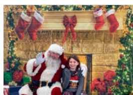
Christmas in Thurmont