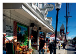
Down on Main Street