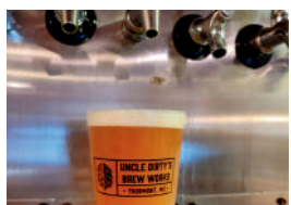
Uncle Dirty's Brew Works