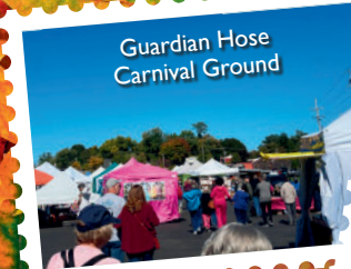
Guardian Hose Carnival Ground